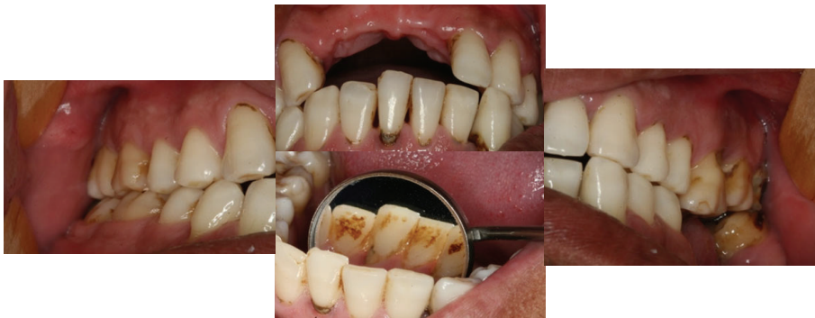
FIGURE 1: Clinical features of the severe periodontal disease at first consultation. Anterior teeth lost and accumulation of gross calculus and tooth pigmentation.