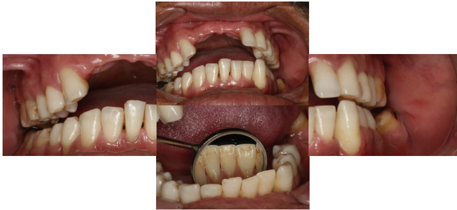
FIGURE 3: Clinical features after periodontal therapy. Good hygiene without calculus or plaque.